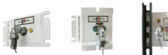
Rub block door models shown with TT420S-LT: Hinged, Adjustable (Patent Pending), Uni-Strut

The patented TT420S-LT (Liquid-Tight) temperature sensors are used to monitor leg and conveyor belt alignment with three versions of rub block doors. All temperature sensors are factory calibrated and come with straight or right angled conduit adapters. These extremely rugged doors are finished with white epoxy to minimize radiant heating effects in outdoor installations. The hinged doors allow easy inspection of the brass rub blocks. The adjustable version allows close positioning to inside corners of machinery casing. See Rub Block Door Assemblies data sheet and installation manual for complete details.