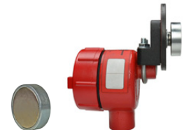
MM-2.00 Mounting Magnet Option (must be used with EZ-100)