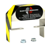
EZ-Mount Disc Guard