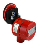
EZ-100 Mounting Option