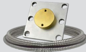
Stainless Steel Jacket Over Polyurethane Cable