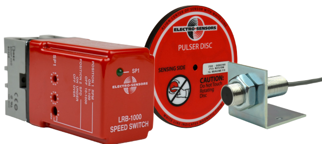
Standard System with: LRB1000 Speed Switch, 906 Speed Sensor, 255 Pulser Disc