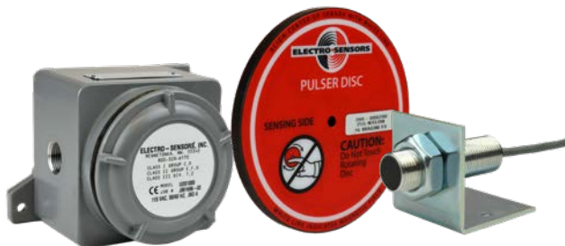
Standard System with: UDS1000 Rotation Reversal Switch, 906B Speed Sensor, 255 Pulser Disc

The UDS1000 is a complete system designed to detect shaft rotation reversal. During operation, the UDS1000 energizes its relay when the monitor shaft is either at rest or rotating in the desired direction. When the monitored shaft rotates in reverse, or the “wrong direction”, the relay de-energizes. The relay contacts can be used for equipment shutdown, to prevent start-up, or to provide an alarm. The UDS1000 is ideal for detecting reverse rotation on Pump Shafts, Motors, Conveyors, Fans/Blowers, and more. The standard UDS1000 system includes the UDS1000 speed switch, a 906B Sensing Head, and a 255 Pulser Disc. Electro-Sensors’ speed switches bring efficiency and safety to your operations by preventing machine damage, product waste, and costly downtime.